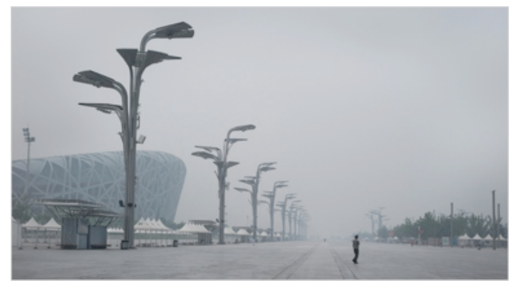
Fig. 4: "On Olympic Boulevard, a year after it was thronged with tourists, a lone guard patrolled last July." – New York Times