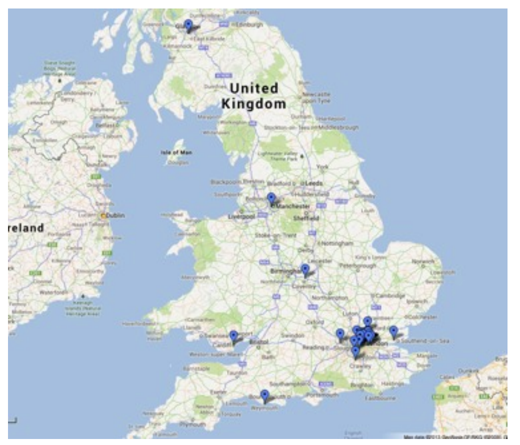
Fig. 1: Map showing the distribution of Olympic events throughout the United Kingdom<sup>7</sup>